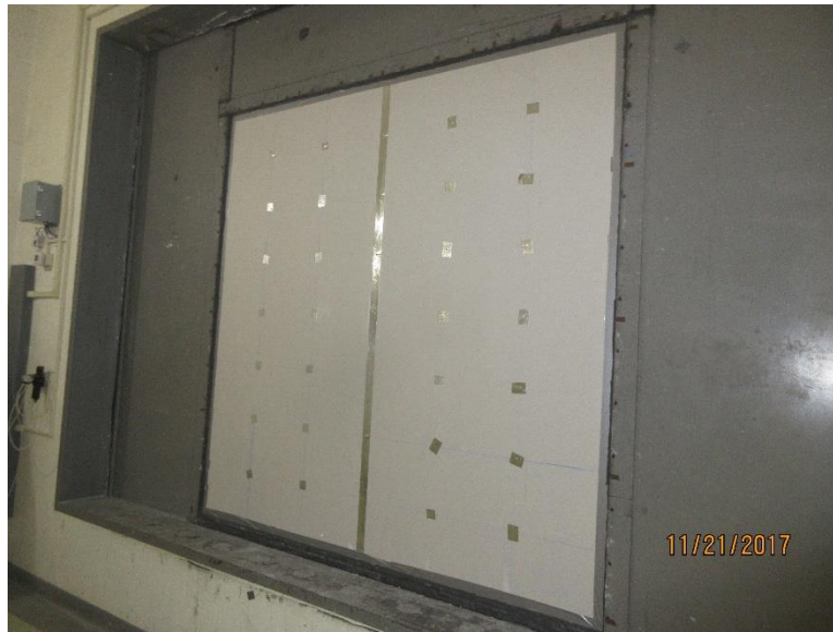
Photo No. 1 Receive Room View of Installed Test Specimen