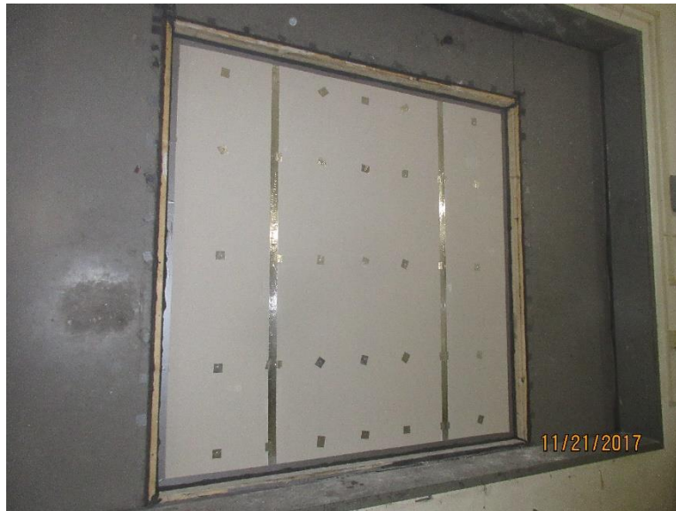
Photo No. 2 Source Room View of Installed Test Specimen