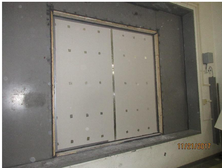
Photo No. 2 Source Room View of Installed Test Specimen