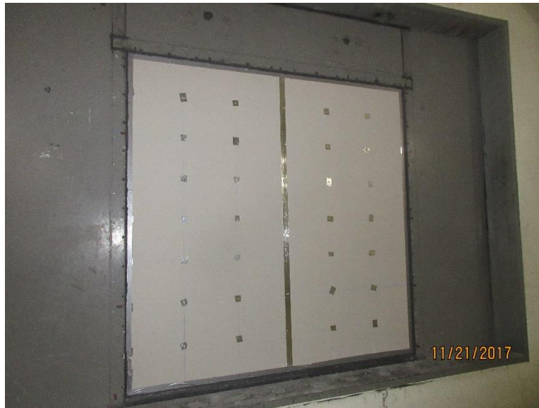
Photo No. 1 Receive Room View of Installed Test Specimen