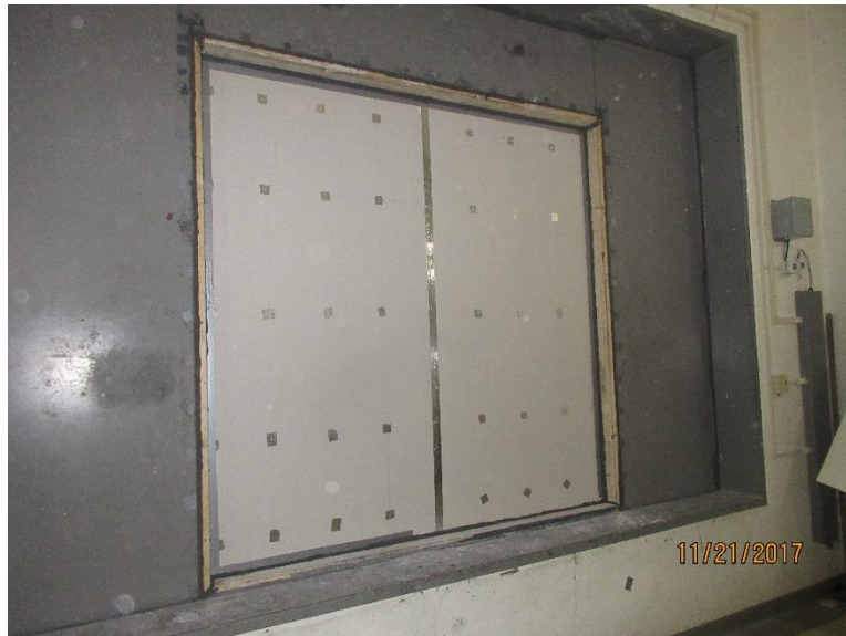
Photo No. 2 Source Room View of Installed Test Specimen