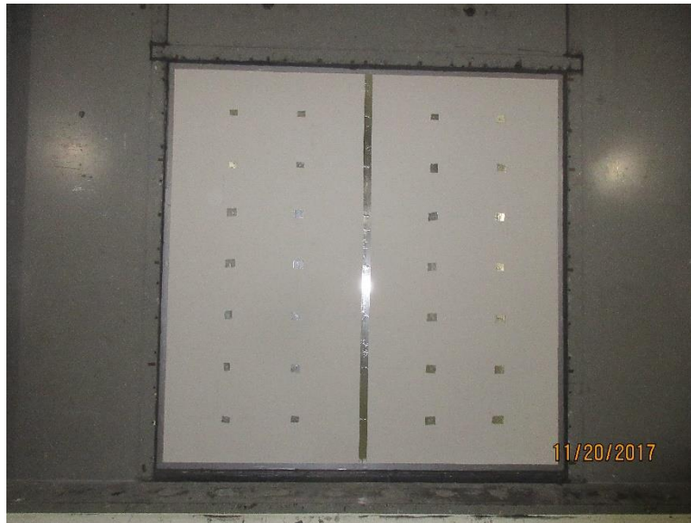
Photo No. 1 Receive Room View of Installed Test Specimen