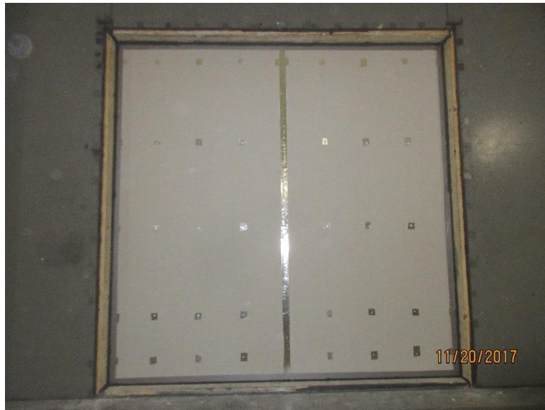
Photo No. 2 Source Room View of Installed Test Specimen