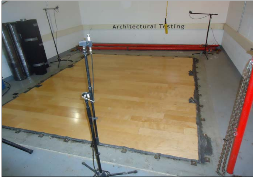
Source Room View of Test Specimen Installation