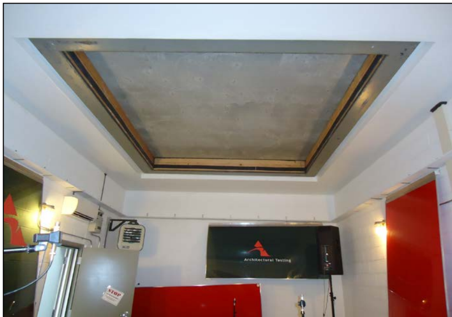
Receive Room View of Test Specimen Installation